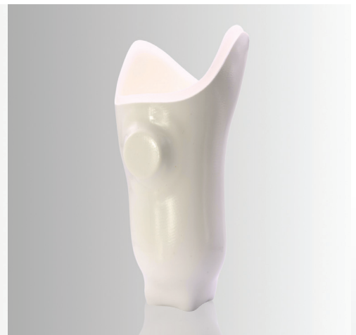
LAMINATE OR PULL SOCKET