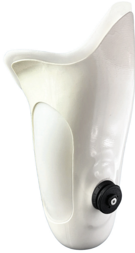
L5783 LOWER EXTREMITY