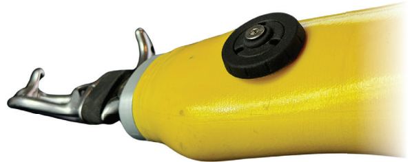
L7406 UPPER EXTREMITY

MEDICARE HAS APPROVED 2 NEW REIMBURSEMENT CODES FOR PROVIDING VOLUME MANAGEMENT SOCKET TECHNOLOGY FOR PATIENT'S REQUIRING A MECHANICAL VOLUME MANAGEMENT SYSTEM.